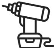
In-house installation service