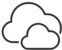
Vapour cured cast stone