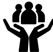
Aftercare plans available